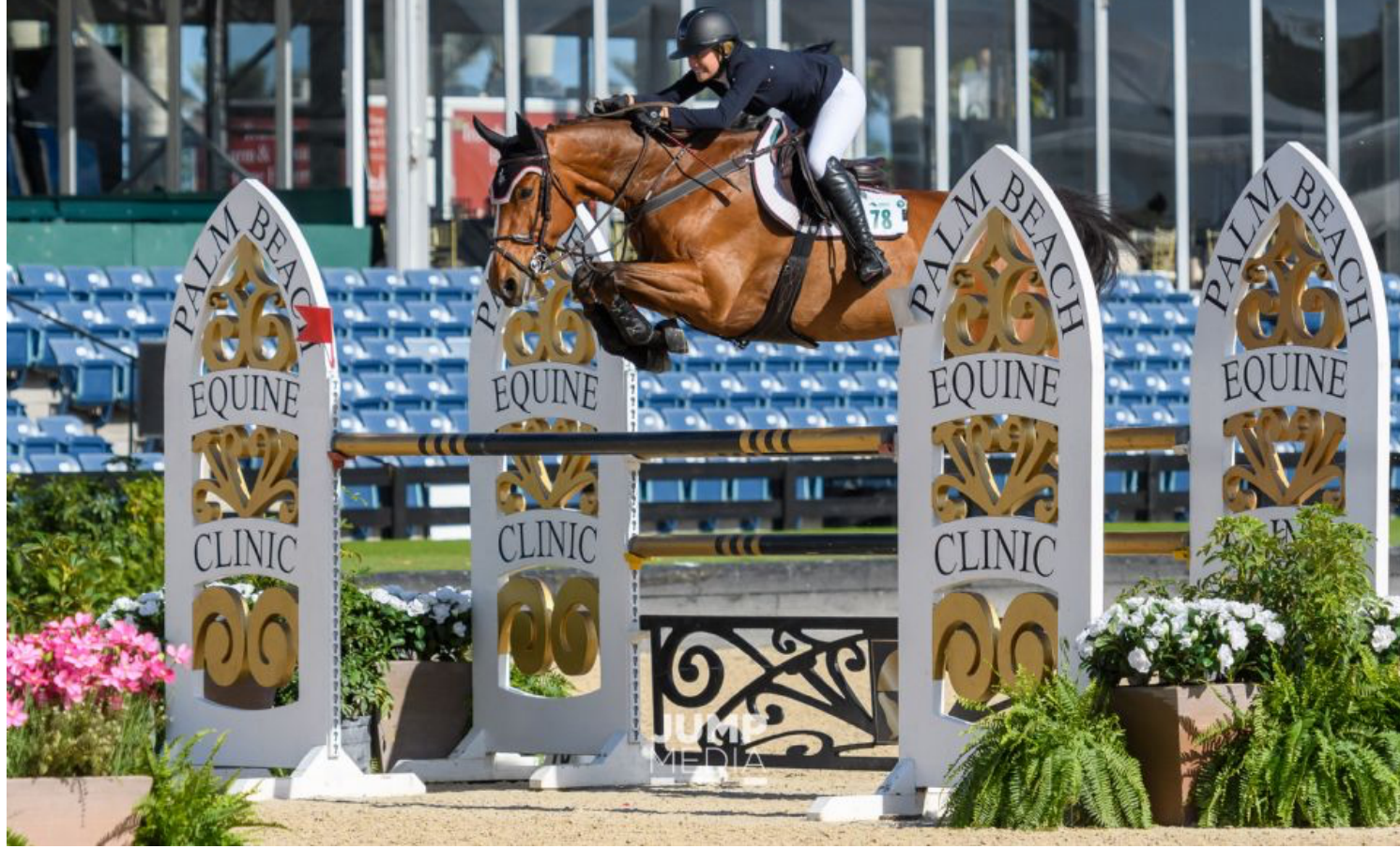
Palm Beach Equine Clinic has a team of veterinarians who specialize in Sport Horse Medicine to keep equine athletes performing at their best.

The goals of Equine Sport Horse Medicine are to keep horses performing at their best, detect subtle changes, appropriately address underlying issues, and correctly diagnose and treat injuries to get horses back to optimum health. Despite being powerful animals, horses are relatively fragile. One day they are competing in perfect form, and the next day they can walk out of their stall lame. Thus begins the process of addressing the underlying issues and determining a treatment plan.